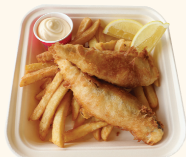
Fish & Chips $14 market fresh battered fish, golden chips, aioli, lemon