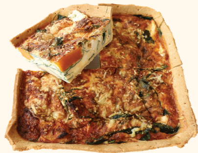
Pumpkin, Feta, Spinach $18