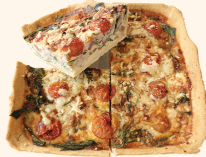
Bacon, Tomato, Cheese, Spinach $20