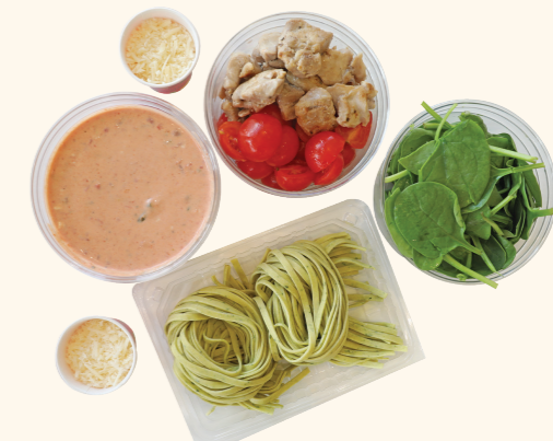
Chicken Rose For 2 $18