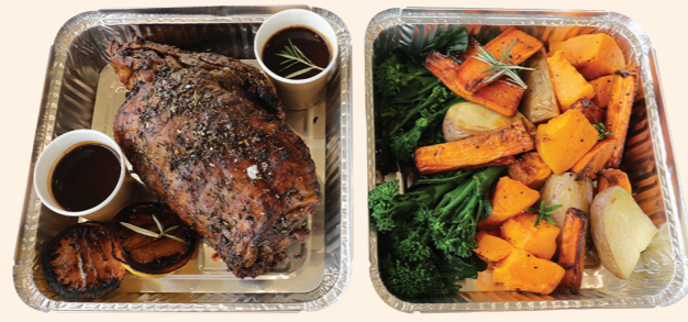
For 4 $58