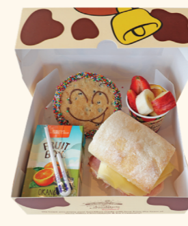
Kids lunchbox $9 ham & cheese baguette, giant choc chip cookie, fresh fruit cup, juice box