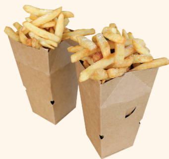
Hot Chippies large box $8