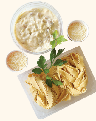
Carbonara For 2 $16