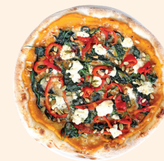
Pumpkin $15 roasted pumpkin base, feta, spinach, fire roasted capsicum (V) ADD $3 maple smoked bacon or chicken