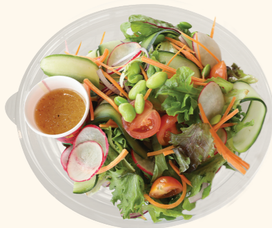
Autumn Garden Salad Large $12 mixed seasonal greens, carrot, radish, edamame beans with citrus orange dressing