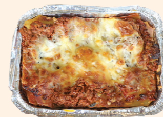
Angus Beef Lasagne For 2 $10 For 4 $18