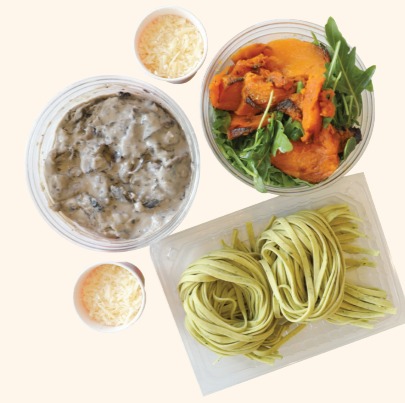
Vegetarian For 2 $16