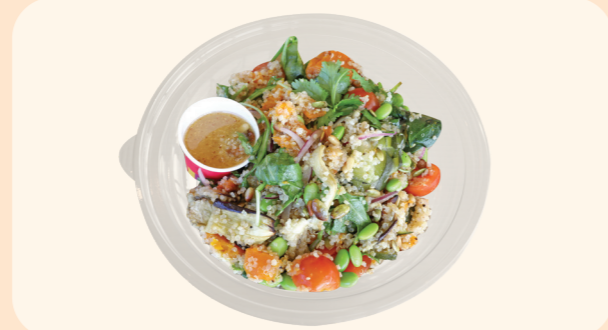
Cauliflower Salad $14 honey & cumin coated, charred baby cobs, dried apricots, goats' cheese, pumpkin seeds, currants, quinoa, vincotto dressing (V)(GF)