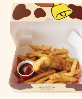
Kids lunchbox $11 market fresh battered fish, golden chips, tomato sauce

SEE OVER FOR OUR SWEET TREAT SELECTION >>>