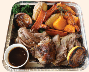
Roast Lamb Meal For 2 $32

Slow cooked Roast Lamb shoulder with garlic and rosemary served with a medley of roast veggies, potato, sweet potato, pumpkin, carrots, broccoli and a little pot of jus