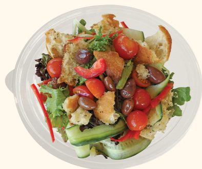
Panzanella Salad $14 heirloom tomatoes, red capsicum, olives, cucumber, rustic croutons (V) ADD chicken $3