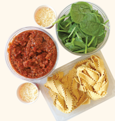
Beef Bolognese For 2 $18