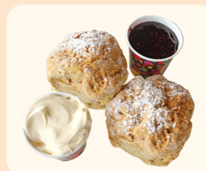
Vanilla Bean Scones For 1 $6 For 2 $9.50 with house-made berry jam and dollop cream