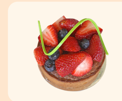
Strawberry Tart $8.50 filled with vanilla crème patisserie with fresh strawberries