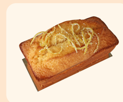
Lemon Tea Cake For 2 $9.50 lovely & tangy tea cake