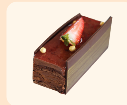
Chocberry Mousse Torte $6.50 choc & raspberry sponge biscuit with dark choc mousse & berry glaze