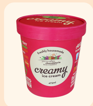
475mL Tub $11.95 Available in 24 flavours