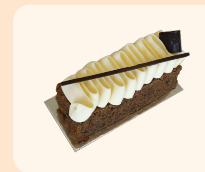
Carrot Cake $7.50 sweet & moist carrot cake with walnuts, topped with cream cheese frosting