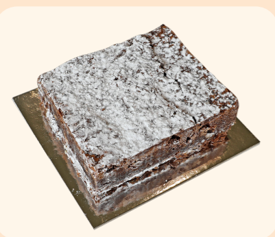
Brownie Block $7 Triple Choc