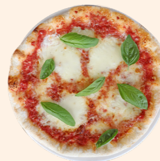
Margherita $14 tomato base, mozzarella, fresh basil (V)