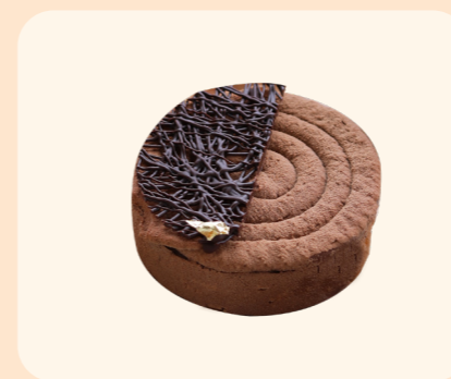
Choc Coconut Tart $7.50 rich chocolate coconut ganache in a crispy tart shell (vegan)