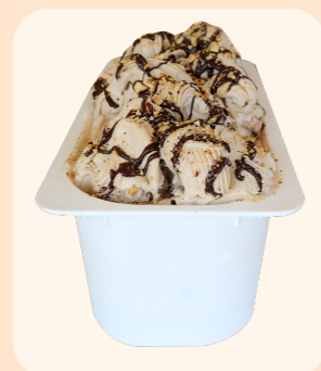
5L Tub $45 Available in 24 flavours