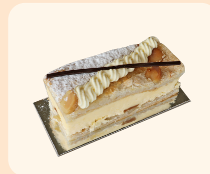
Macadamia Cheese Cake $8.50 light cheesecake with caramelised macadamia daquoise meringue