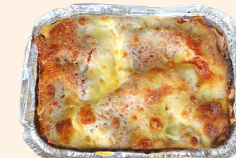
Roast Veg Lasagne For 2 $10 For 4 $18