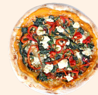
Pumpkin $15 roasted pumpkin base, feta, spinach, fire roasted capsicum (V) ADD $3 bacon