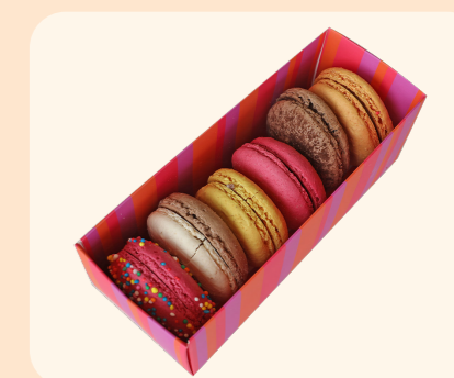
French Macarons 6 Pack $12 12 Pack $24 Assorted flavours