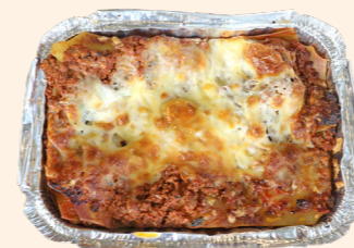
Angus Beef Lasagne For 2 $10 For 4 $18