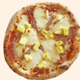
Ham & Pineapple $15.50 double smoked ham, pineapple, mozzarella