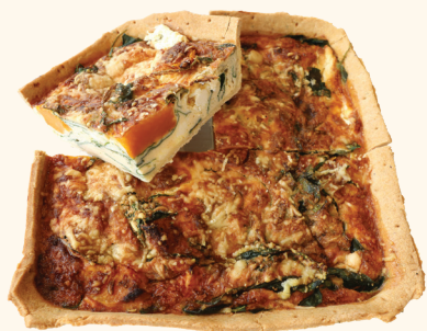
Pumpkin, Feta, Spinach $18