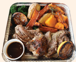
Roast Lamb Meal For 2 $32

Slow cooked Roast Lamb shoulder with garlic and rosemary served with a medley of roast veggies, potato, sweet potato, pumpkin, carrots, broccoli and a little pot of jus