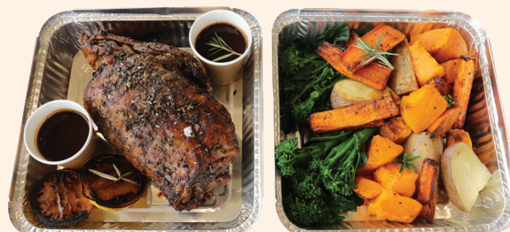
For 4 $58

Slow cooked Roast Lamb shoulder with garlic and rosemary served with a medley of roast veggies, potato, sweet potato, pumpkin, carrots, broccoli and a little pot of jus