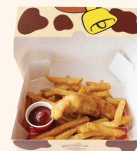
Kids lunchbox $11 market fresh battered fish, golden chips, tomato sauce