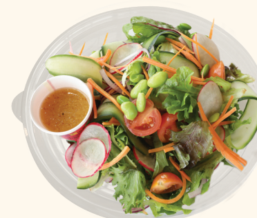
Autumn Garden Salad Large $12 mixed seasonal greens, carrot, radish, edamame beans with citrus orange dressing