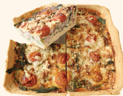
Bacon, Tomato, Cheese, Spinach $20