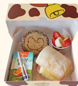
Kids lunchbox $9 ham & cheese baguette, giant choc chip cookie, fresh fruit cup, juice box