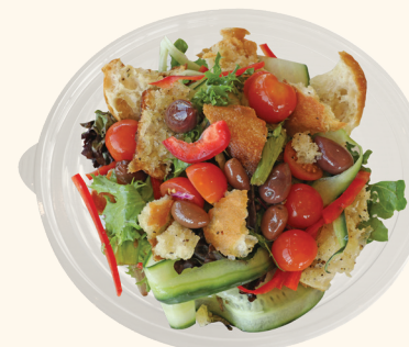
Panzanella Salad $14 heirloom tomatoes, red capsicum, olives, cucumber, rustic croutons (V) ADD chicken $3