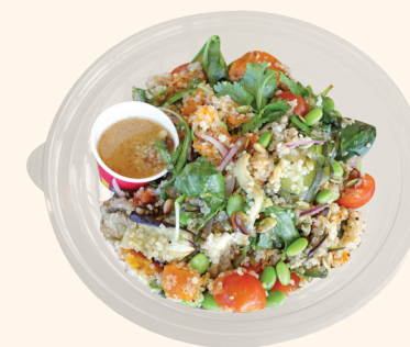
Cauliflower Salad $14 honey & cumin coated, charred baby cos, dried apricots, goats' cheese, pumpkin seeds, currants, quinoa, vincotto dressing (V)(GF)