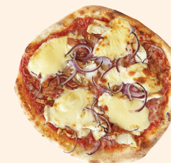
BBQ Meat Lovers $17 chicken, bacon, double smoked ham, Spanish onion, cheddar