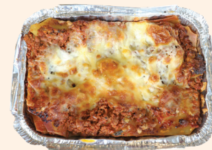
Angus Beef Lasagne For 2 $10 For 4 $18