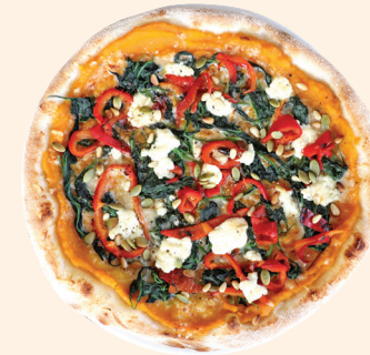
Pumpkin $15 roasted pumpkin base, feta, spinach, fire roasted capsicum (V) ADD $3 maple smoked bacon or chicken