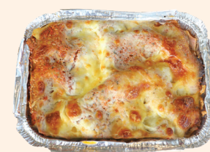
Roast Veg Lasagne For 2 $10 For 4 $18